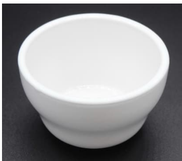
Bright White 8 Oz Bouillon Cup