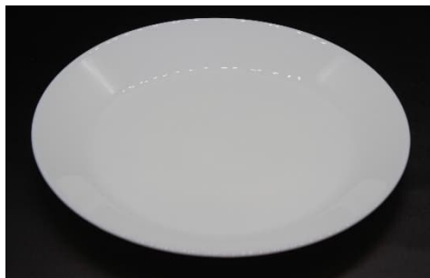
Bright White 7 3/4 China Plate