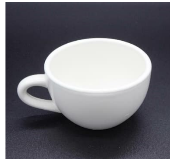
American White Coffee cup