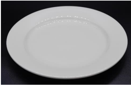
American White 10 1/2 Plate