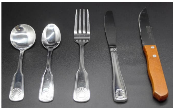
Silverware and Steak knife