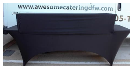
8 Ft Bar Top with black linen