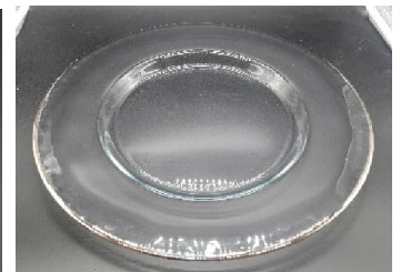
Glass Silver Rim