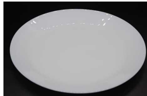
Bright White 9 3/4 China Plate