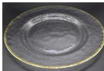
Glass Gold Rim