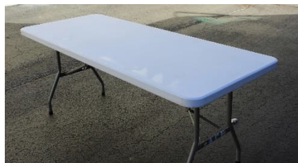
6 Ft. Rectangle Table