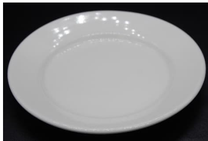
American White 7 1/2 Plate